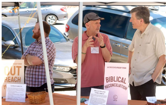
Kickoff Sunday Ministry Fair

Abide is back in full swing too! Abide Jr: High meets Wednesdays during PEAK, from 6:30-8 PM and Abide High School meets Thursday nights